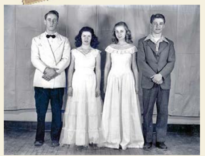
Prom circa 1947