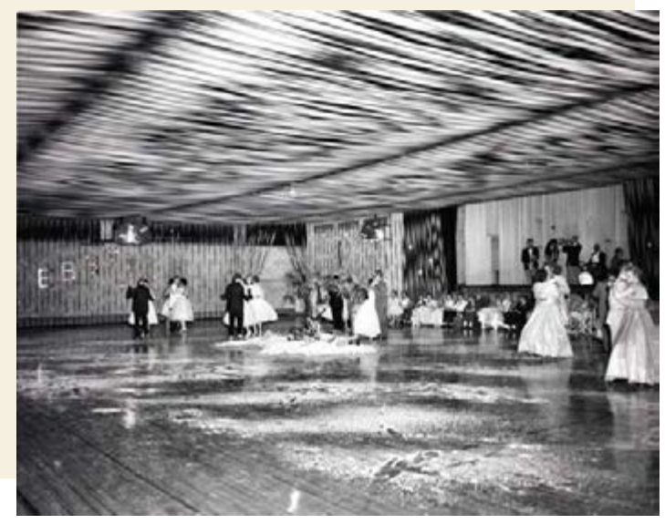
Rehmstadt Gym - Prom 1958