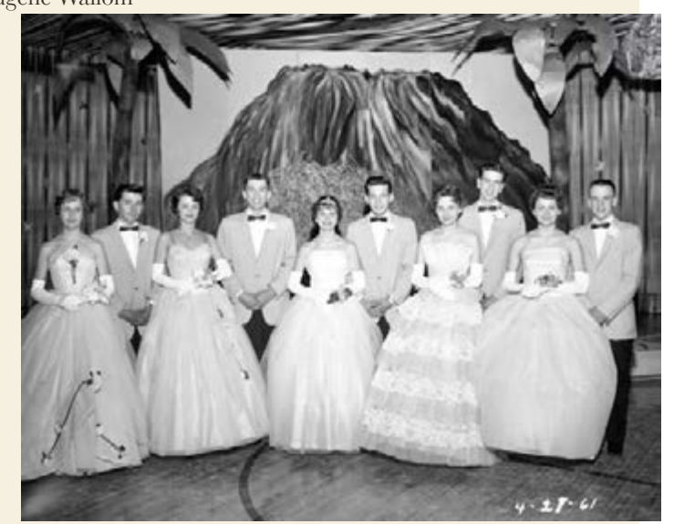
Prom Court 1961