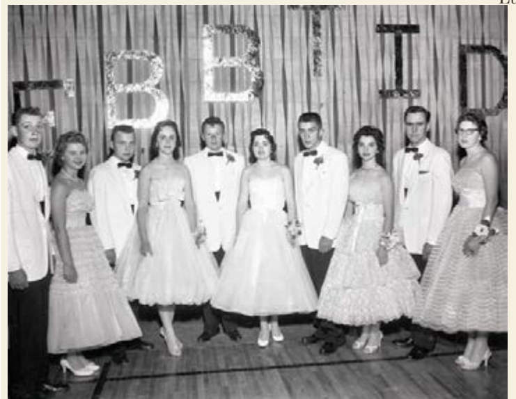
Prom Court 1958