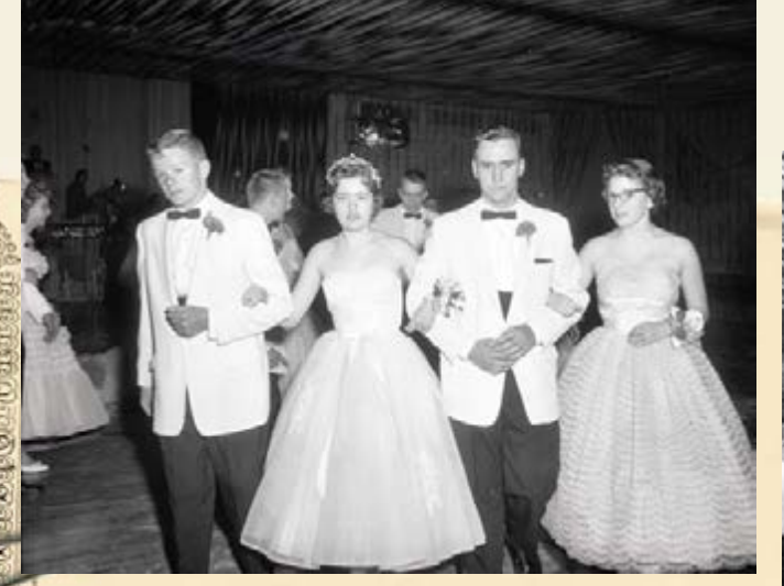
Grand Procession 1958