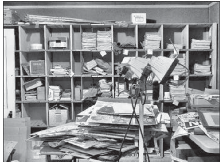
These are the second floor rooms that will be renovated. Walls must be removed, loose plaster removed and replaced with drywall, 9' insulated dropped ceilings hung, flooring overlaid and tiled, and furnace/air-conditioning installed.