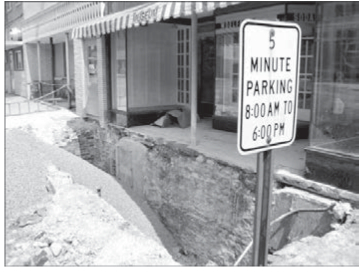
Monticello's Main St. construction before the October 2010 completion. The museum's under-sidewalk coal bin had to be filled in to accommodate the new sidewalks.