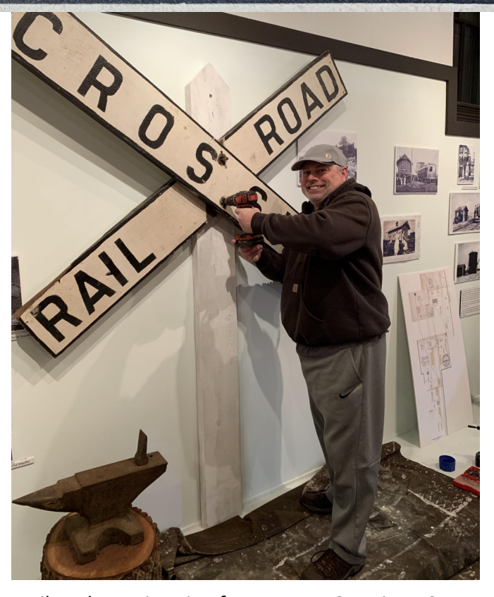
Railroad crossing sign from Exeter Crossing. Come see it any Saturday and visit with docents.