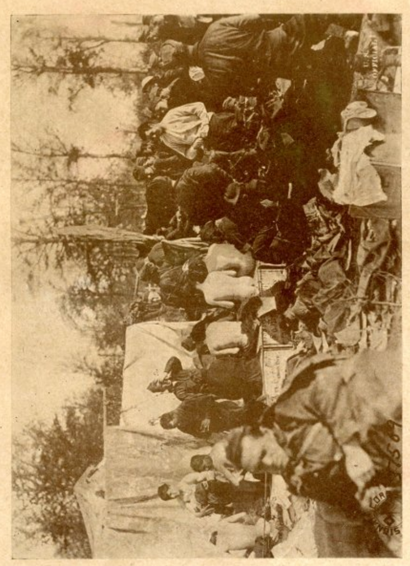
General view of the delousing station located in the Argonne Woods. Many of the men had their first bath in several months in these tents, and there is still a shadow of doubt in many of their minds as to whether or not they left all their "pets" at this place. Oct. 21st.