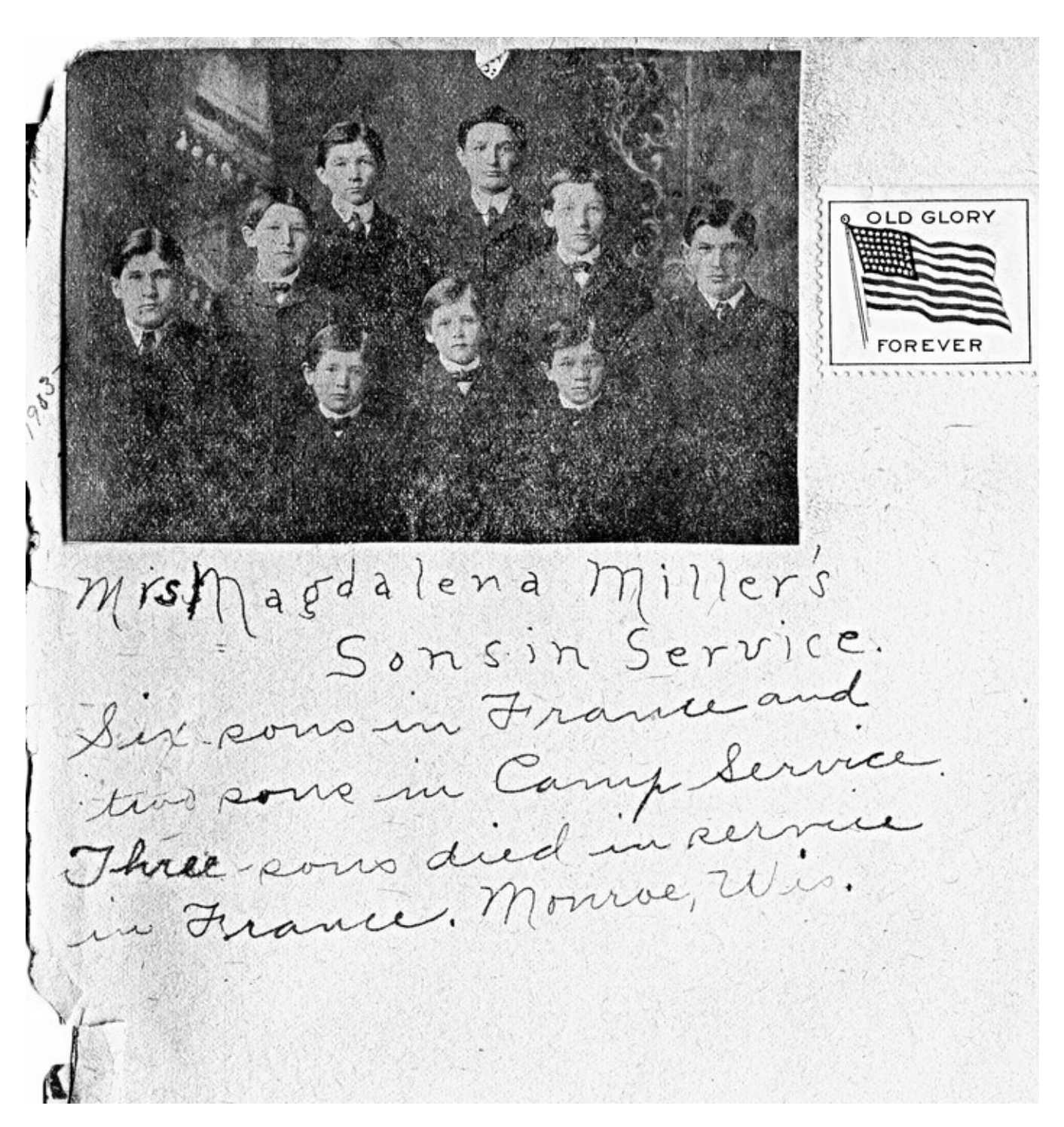
End of page 56