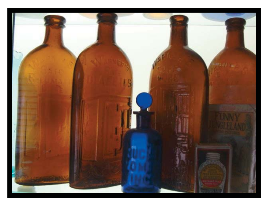
Monticello Area Historical Society