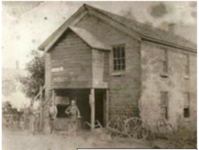
Blacksmith shop in late 1800's